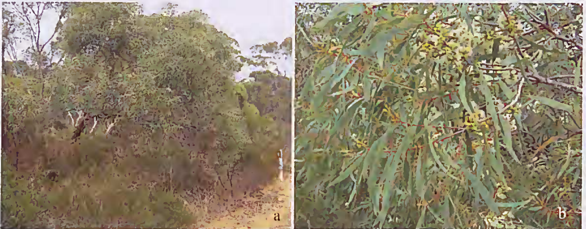
Figure 5: Eucalyptus wimmerensis subsp. pallida . a. mallee, W of Diapur; b. branchlet, Diapur.

Eucalyptus wimmerensis subsp. pallida differs from the typical subspecies primarily by its smaller, more shrubby habit, its substantial stocking of brownish box bark, its duller, bluish adult leaves and generally smaller fruits.